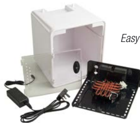
Easy clean cabinet designs