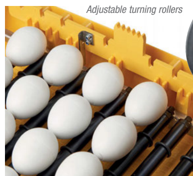
Adjustable turning rollers

Brinsea's Induced Dual Airflow system represents a breakthrough in incubator design and achieves new levels of temperature consistency for optimum incubation conditions.